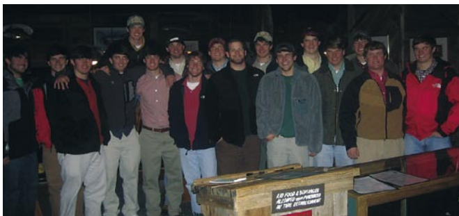
Members of the 2004 and 2005 pledge class on spring break. For more chapter news, turn to page 2.