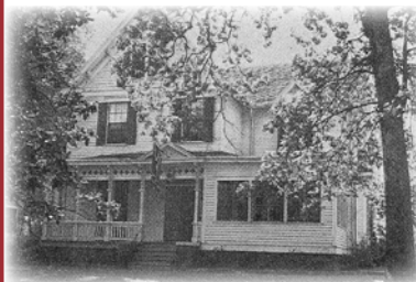
The house on Milledge