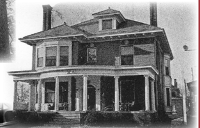
The house on Hancock