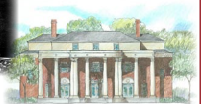
New house to be built