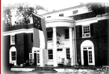
Current KA house