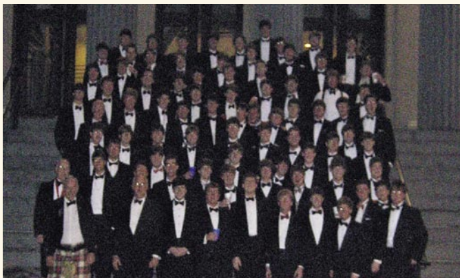
Gamma Brothers celebrate Lee's 200th birthday in historic Savannah, GA on the weekend of January 19-21, 2007. Until 1984, Georgia observed this annual occurrence as an official state holiday.